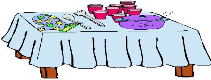
TABLE TOP SALE AT RUDSTON VILLAGE HALL