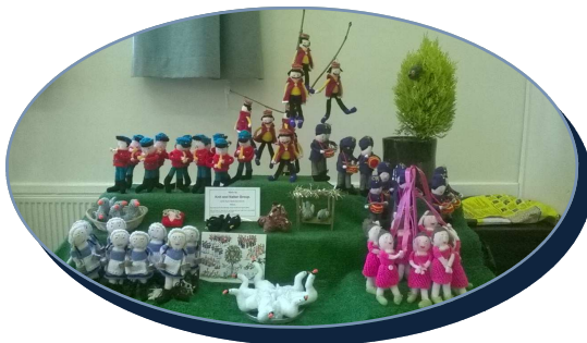
An exhibit from the “Knit & Natter Group”